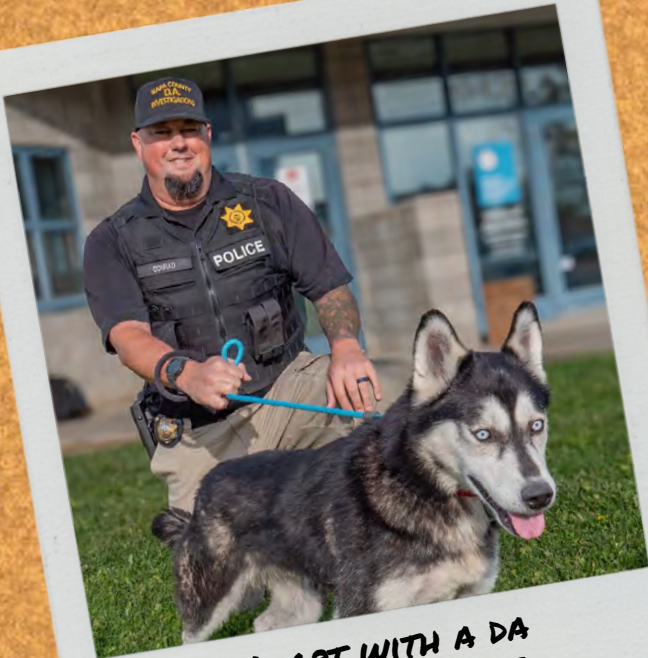
ADOPT WITH A DA DECEMBER 2023