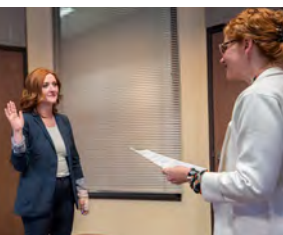
Two Attorneys Join the Napa DA's Office