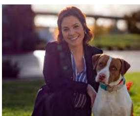
Out and About in the Community