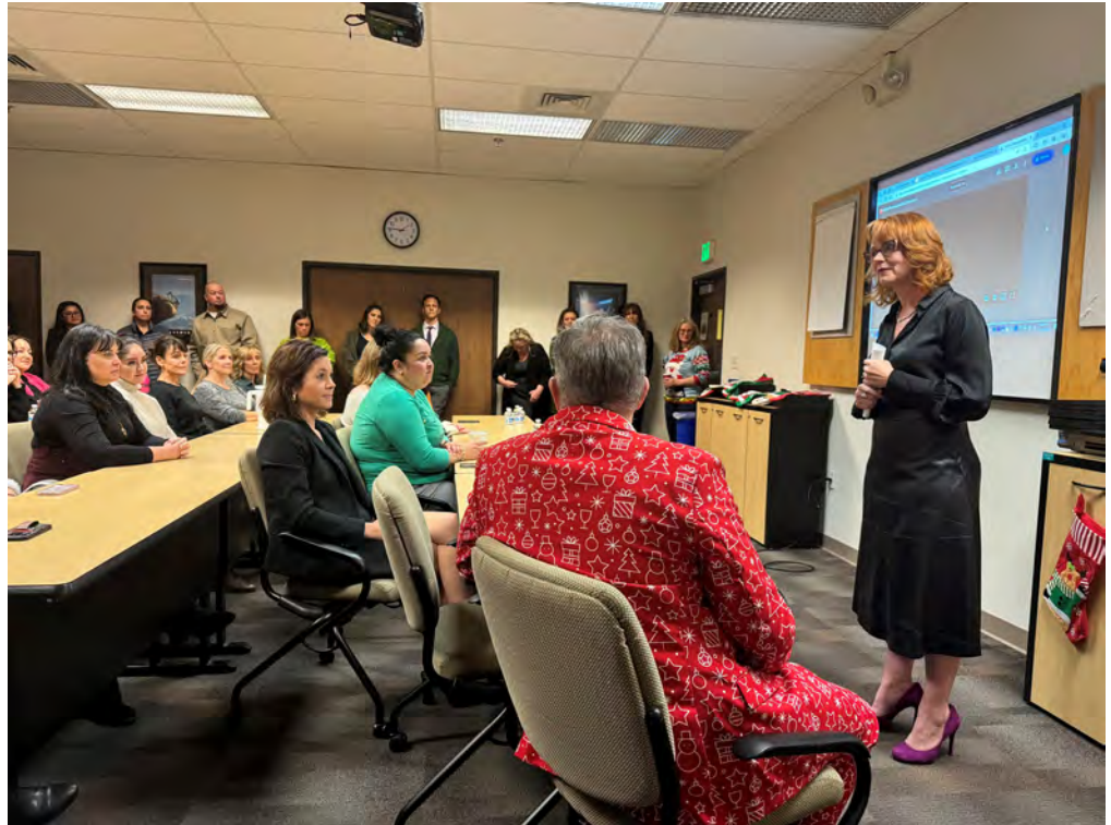
Napa County District Attorney Allison Haley reflects on the events of 2023 with the office during a recent all-staff meeting.

The jury also found true the special circumstances of personally and intentionally