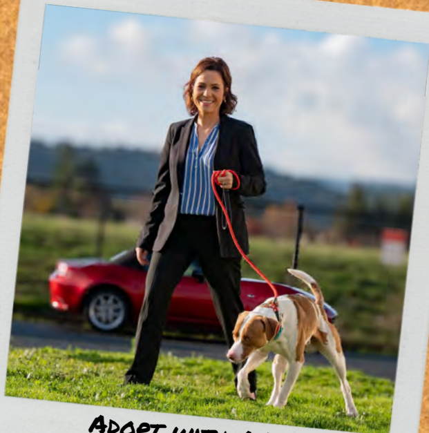
ADOPT WITH A DA DECEMBER 2023