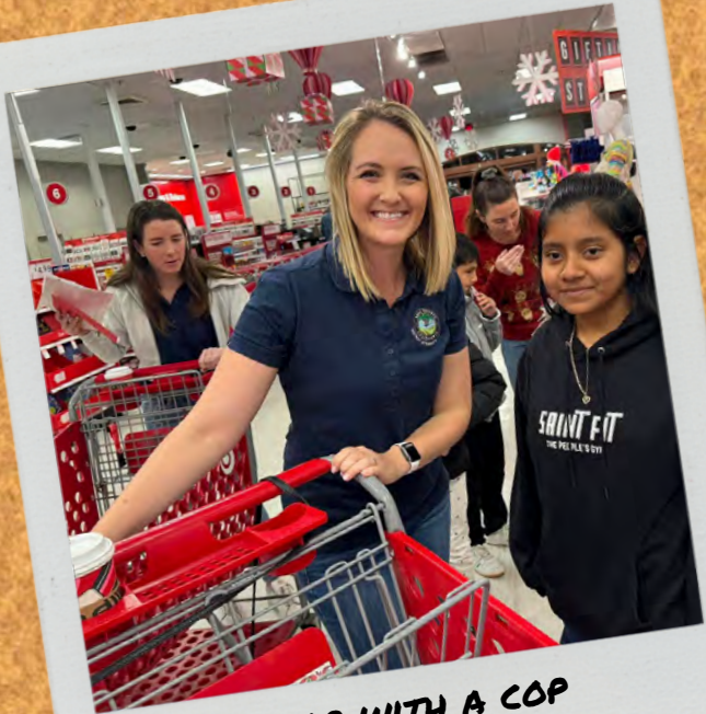
SHOP WITH A COP 12/09/2023