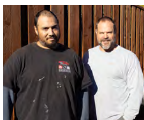
Building a Bridge to a Sober Life in Napa