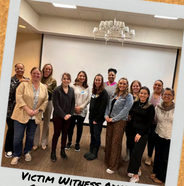
VICTIM WITNESS ADVOCATE COORDINATOR ACADEMY 12/7/2023